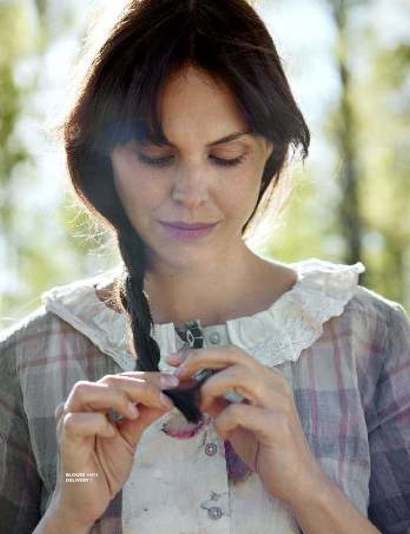
BLOUSE 44818 DELIVERY 1