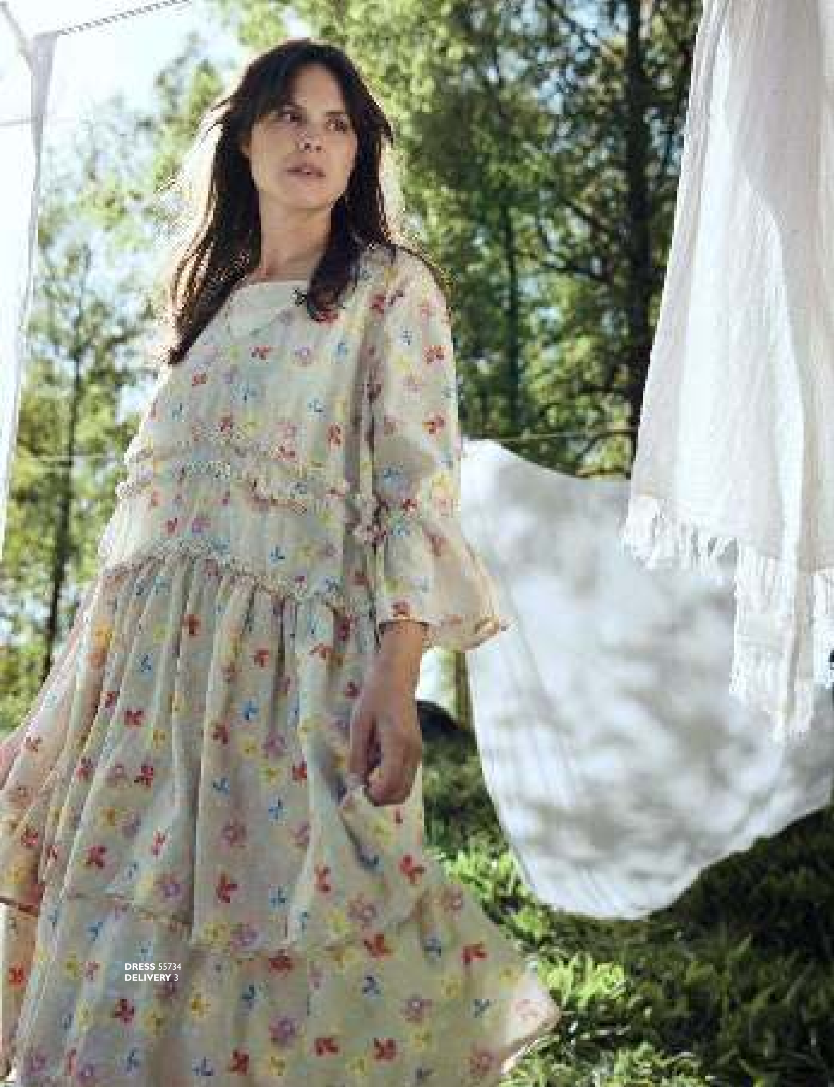
DRESS 55734 DELIVERY 3