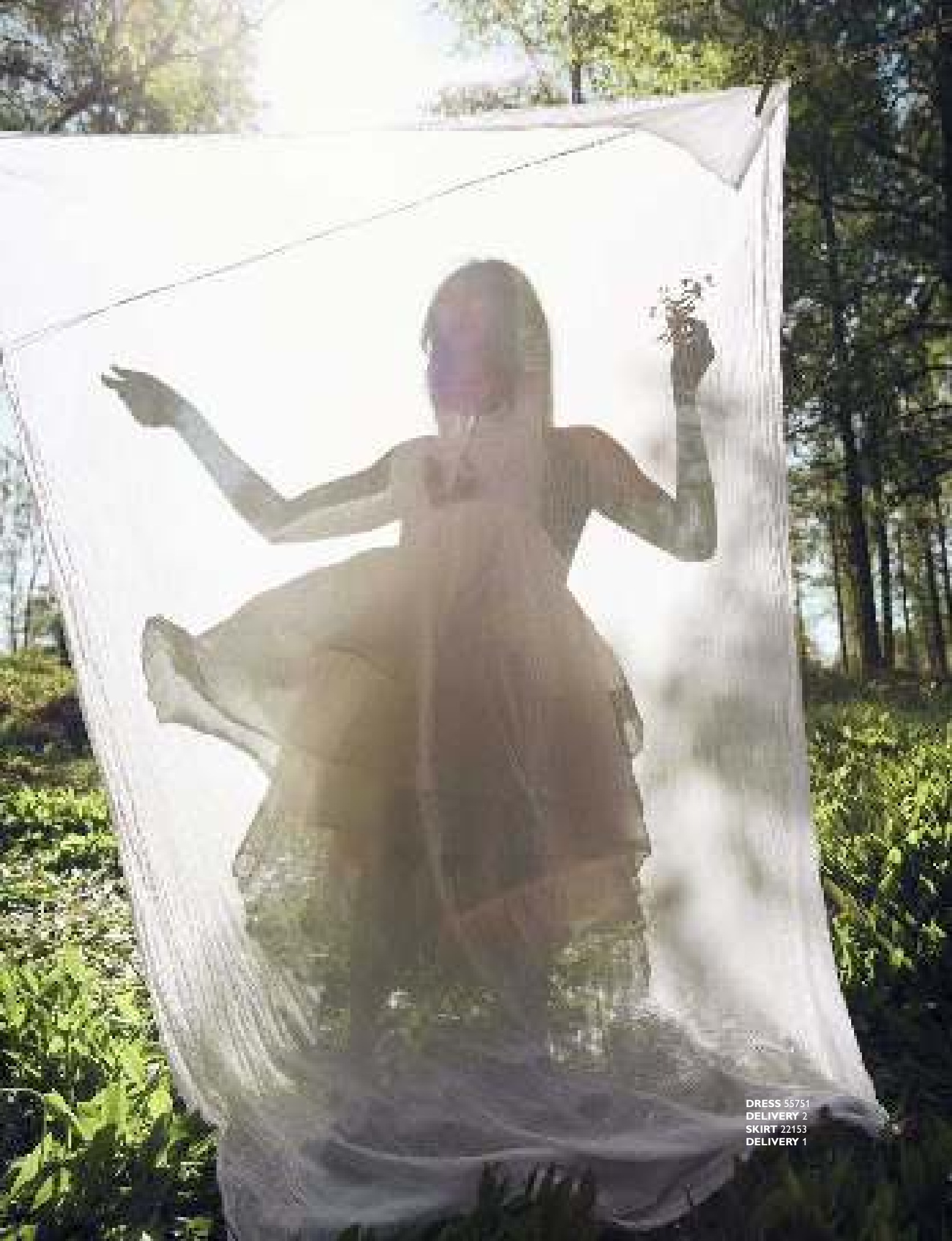
DRESS 55751 DELIVERY 2 SKIRT 22153 DELIVERY 1