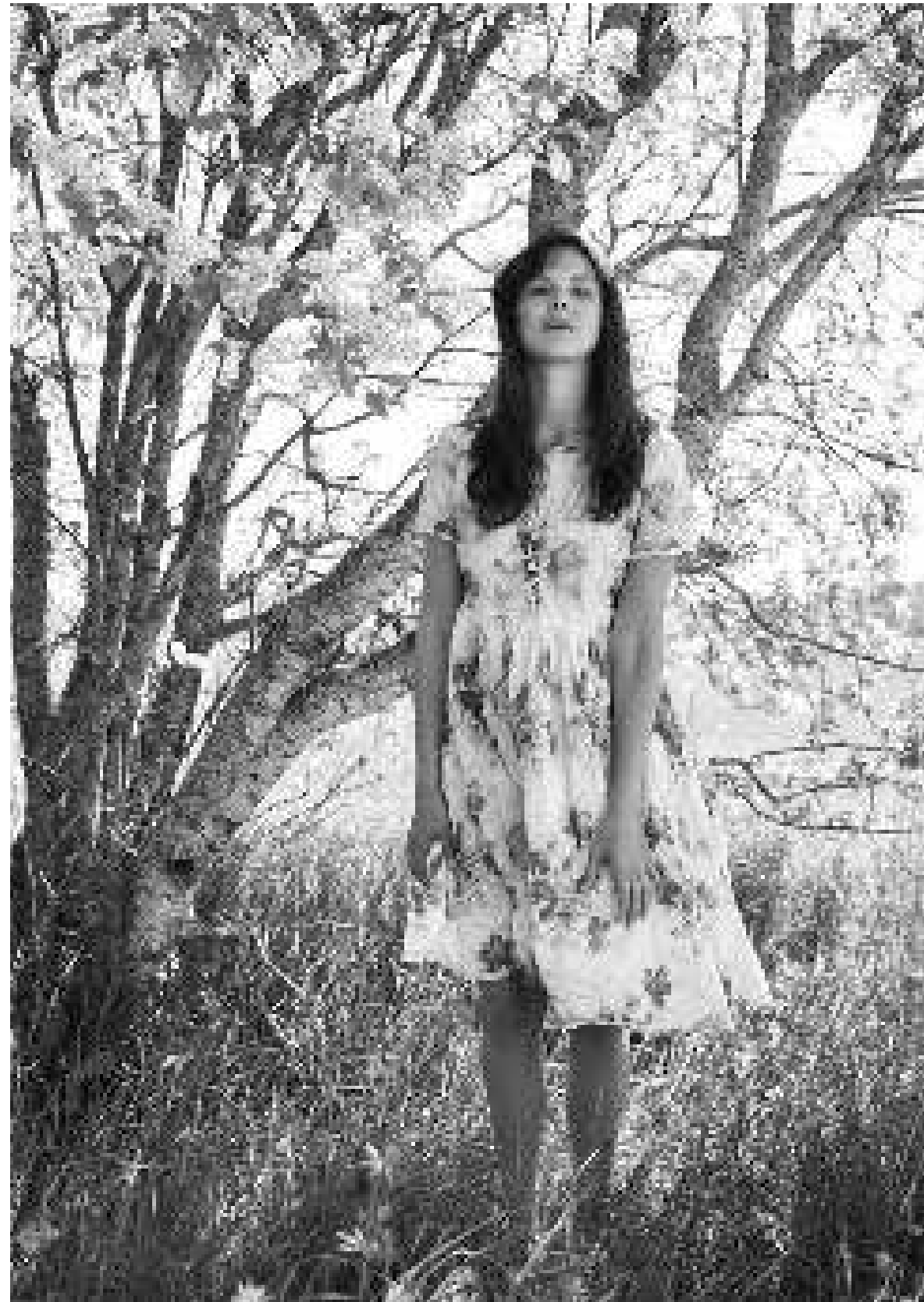
DRESS 55748 DELIVERY 1