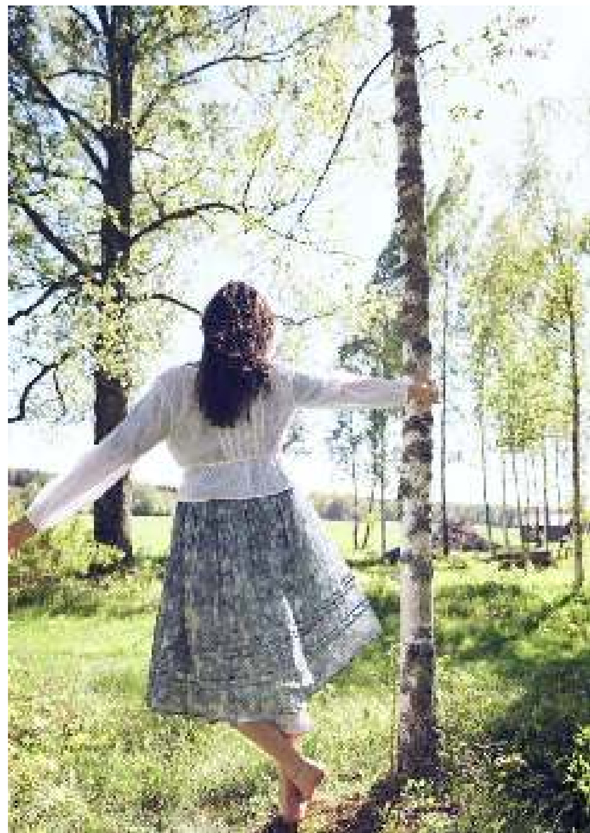
BLOUSE 44832 DRESS 55735 TROUSERS 11372 DELIVERY 2